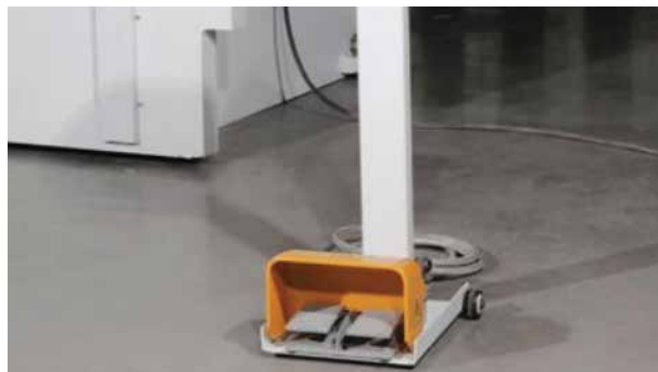
MOVABLE PEDAL SWITCH STATION WITH EMERGENCY STOP BUTTON