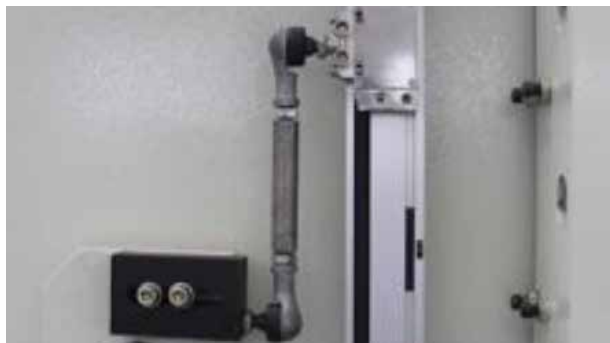
PRECISION GIVI GRATING RULER