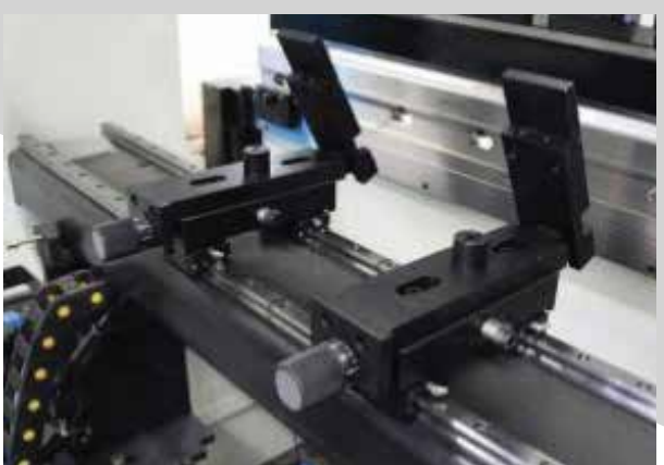
ADH CUSTOM DESIGN BACK-STOP FINGERS