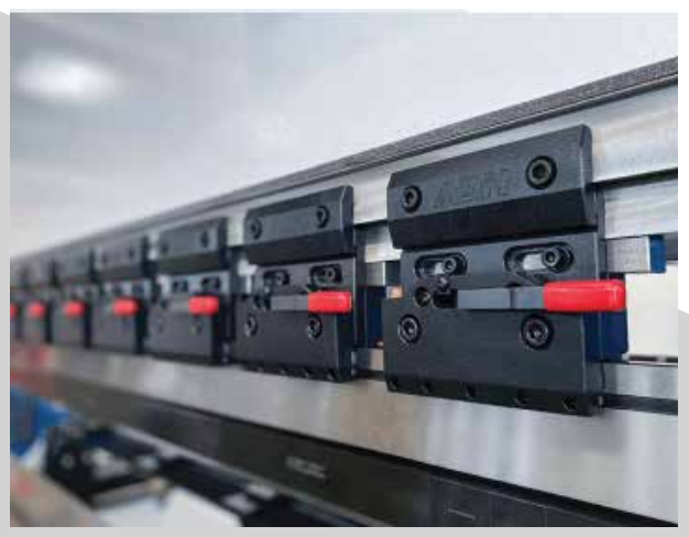
ADH FAST CLAMPING SYSTEM