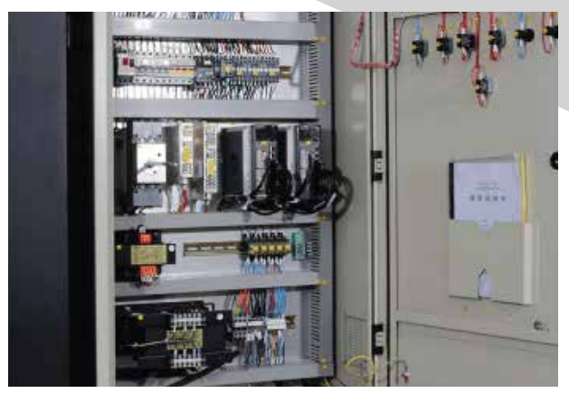
FRENCH SCHNEIDER ELECTRONICS