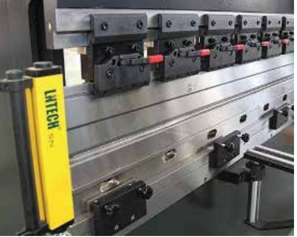
LHTECH LIGHT CURTAIN SAFETY