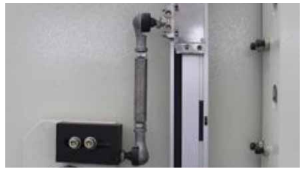
PRECISION GIVI GRATING RULER