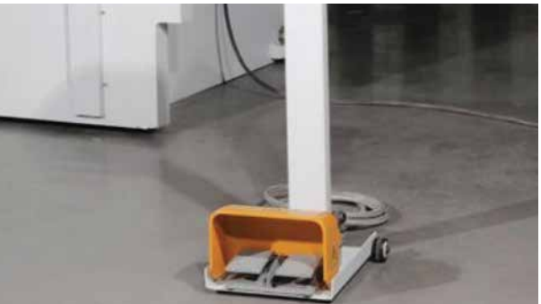
MOVABLE PEDAL SWITCH STATION WITH EMERGENCY STOP BUTTON