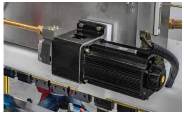
CHINA ESTUN SERVO MOTOR