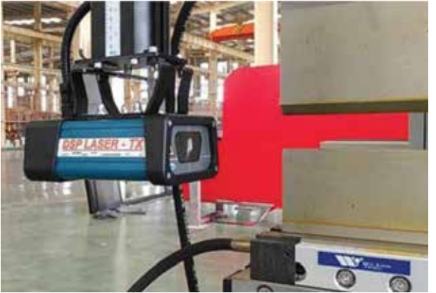
DSP LASER PROTECTION SAFETY SYSTEM - OPTION