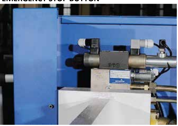
PRECISION GERMAN HAWE HAUDRAULIC VALVE